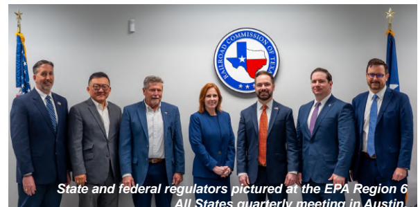
State and federal regulators pictured at the EPA Region 6 All States quarterly meeting in Austin.

The meeting focused on advancing cooperative federalism and strengthening collaboration on regulatory priorities, sharing updates and continuing important conversations about issues affecting communities, natural resources and the environment across the South-Central Region.