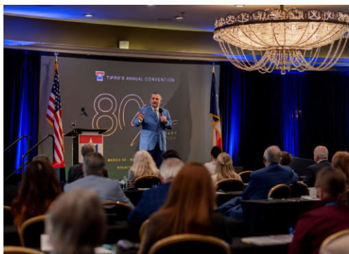
U.S. Senator for Texas Ted Cruz reviews energy-related bills he is working to get passed into law by Congress.

View more pictures from TIPRO's Annual Convention online here!