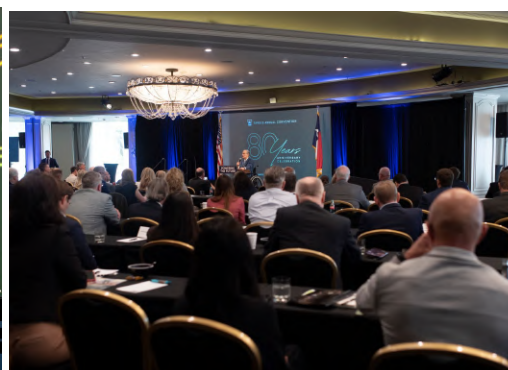
TIPRO's 80th Annual Convention