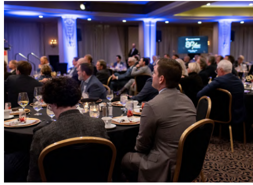
TIPRO Chairman's Dinner