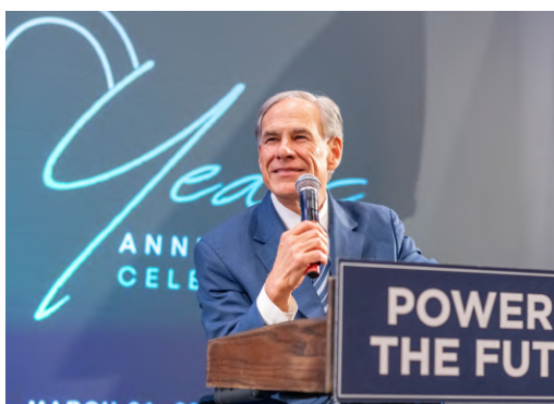
Governor Abbott highlights the critical role the oil and gas industry plays in supporting the Texas economy.