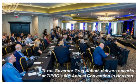
Texas Governor Greg Abbott delivers remarks at TIPRO's 80 th Annual Convention in Houston.