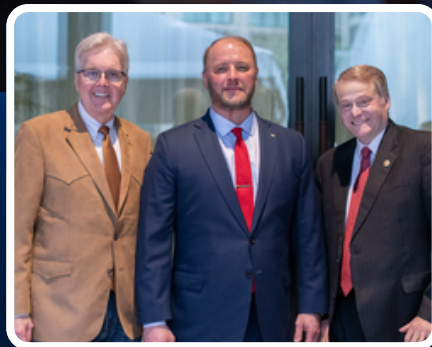
Oil & Gas Policy Updates