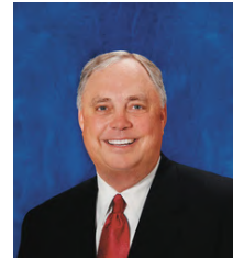
Texas House Representative Drew Darby (District 72)

Exporting Freedom - The Role of the Port of Corpus Christi - 10:25 a.m.