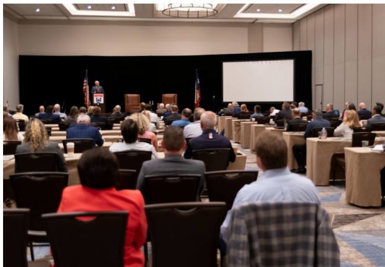
TIPRO members hear about priorities facing the oil and natural gas industry during TIPRO's Summer Conference.