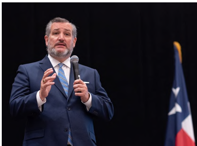
U.S. Senator Ted Cruz provides an update on what's happening in Congress and discusses his concerns about increasing attacks on the country's oil and natural gas industry from the Biden Administration.