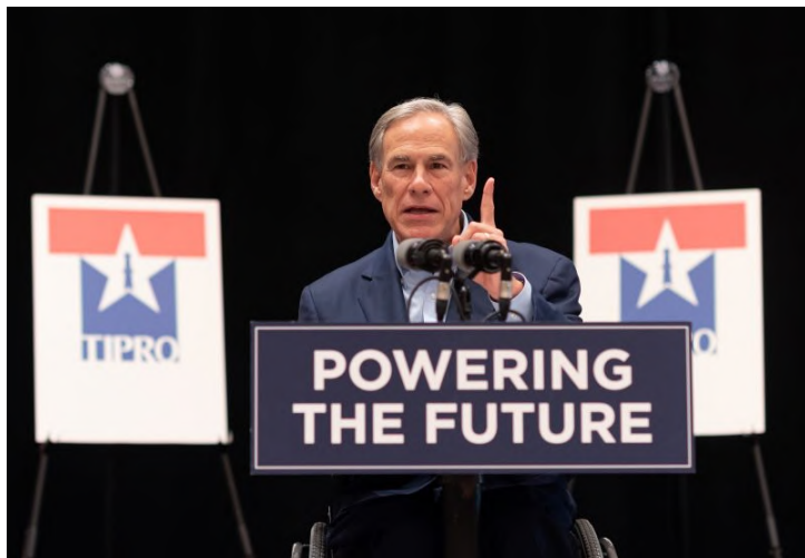
Texas Governor Greg Abbott gives a keynote address to energy leaders and members of TIPRO at the association's Summer meeting, promising to keep Texas the energy capital of the world, spur growth and expand job creation in the industry.