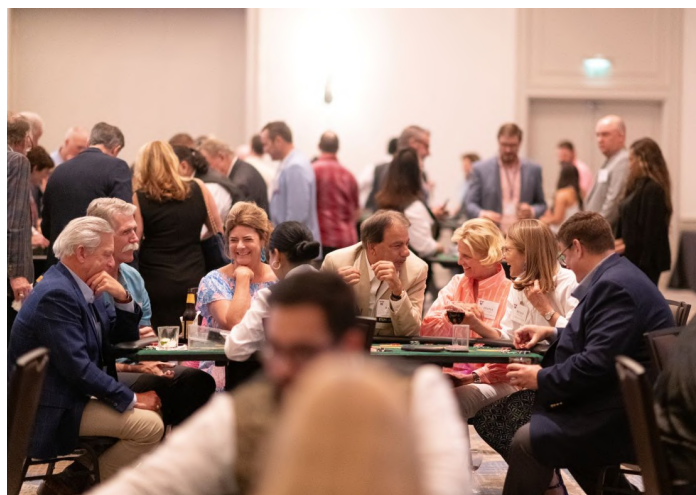
TIPRO members enjoy an evening of casino night games and fun before the conclusion of the 2023 TIPRO Summer Conference.