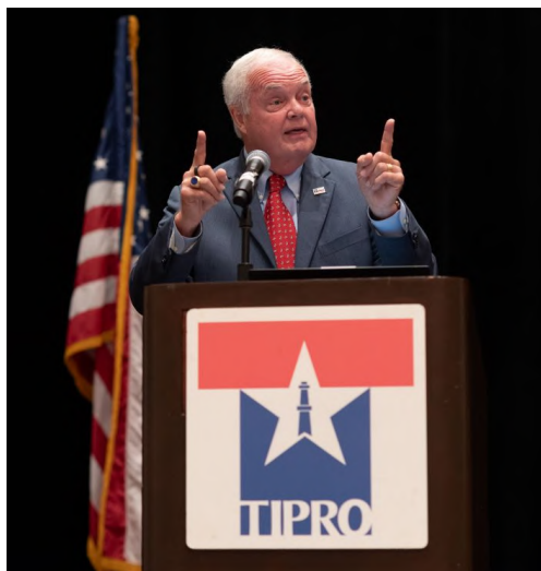
Texas Railroad Commissioner Wayne Christian promotes the importance of Texas' oil and natural gas industry at TIPRO's conference in San Antonio.