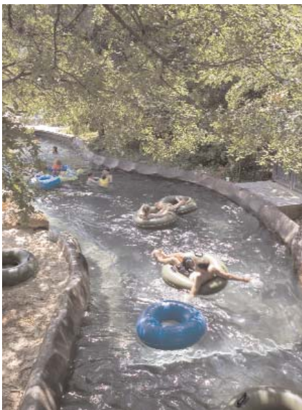
Families always enjoy hopping on a tube and floating on the Ramblin' River.

H ot topics and hot temperatures will merge for a cool time at TIPRO's Annual Summer Conference August 12-14 (Thursday – Saturday) in San Antonio at the Hyatt Hill Country Resort. Politics, tax and environmental issues will balance networking with colleagues and fun with family and friends at this great end-of-summer venue.